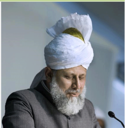
Hazrat Mirza Masroor Ahmad (atba) Khalifatul Masih V