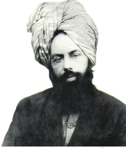
Hazrat Mirza Ghulam Ahmad as The Promised Messiah & Mahdi 1835 - 1908