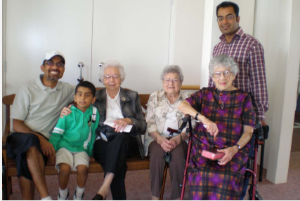
Majlis Bait-ul Huda